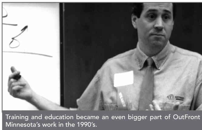
Training and education became an even bigger part of OutFront Minnesota's work in the 1990's.

OutFront Minnesota's work at the capitol again paid off when, in 2004-2006, anti-GLBT forces tried to write discrimination against same-sex couples into the constitution by prohibiting them from marrying, or receiving any form of legal recognition. OutFront Minnesota played a key role in preventing the anti-marriage amendment from going to voters and throwing the rights of the minority up for a popular vote. In the fall of 2006, OutFront Minnesota's political action committee helped elect a fair-minded majority to the Minnesota legislature.