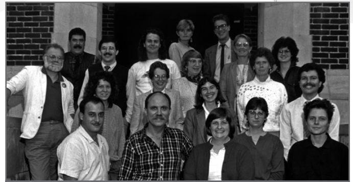
First Board and Staff – 1987

and Lesbian Community Action Council with a Board of Directors and a staff of one, commencing operations in January 1987.