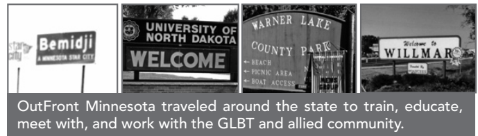
OutFront Minnesota traveled around the state to train, educate, meet with, and work with the GLBT and allied community.

used this new strength to successfully beat back efforts to repeal the human rights protections so hard-won a decade before.